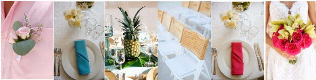
ENHANCE YOUR EVENTS WITH OUR DECOR OPTIONS